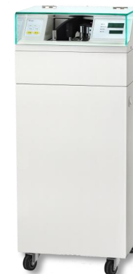
Model FD-E with anti-shutter