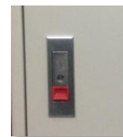
Back door key